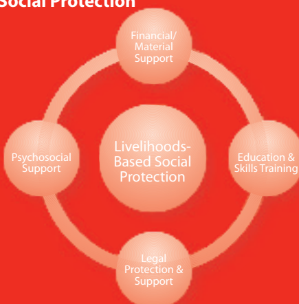
Figure 1: Elements of Livelihood-based Social Protection